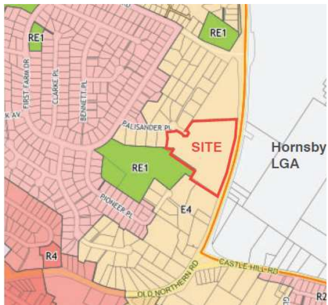
E4 Environmental Living Zoning