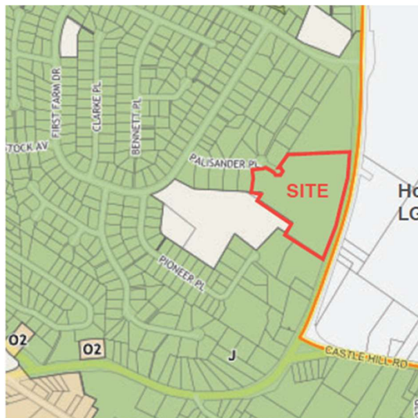
9m Maximum Height of Buildings